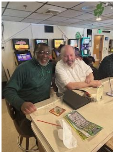
Of course, the celebrations continued with St. Patrick's Day and the corn beef and cabbage.