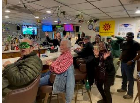
Post 22 Family members celebrating Mardi Gras with traditional pancakes and sausage, beads, and plenty of laughter.