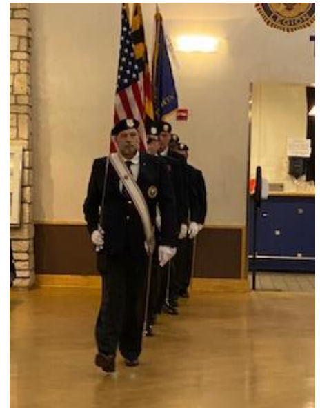
Building partnerships in the community, helped the Post to forge a lasting bond with the Knights of Columbus Color Corp who participated in a ceremony honoring WWII and Korean War veterans in October.