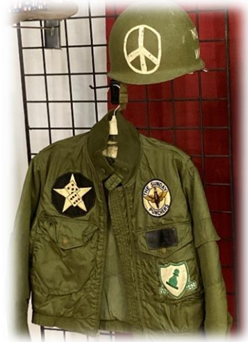
Vietnam War Memorabilia

The exhibit was awesome and the pictures I've included are only a sample of what he had displayed. I encourage you all to visit the Foundation website and see all the great things they are doing to 'To Keep the Promise to Never Forget'. Good job, Chuck.