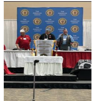
AL Riders presenting check for $210,000 during Department Convention.

Just this year alone the Maryland Chapter raised $210,000. We thank everyone who supported this year's ride. Check out the next newsletter for other highlights and chapter events. In the meantime, remember we meet the first Wednesday of the month at 7:00 PM. Come out and get involved.