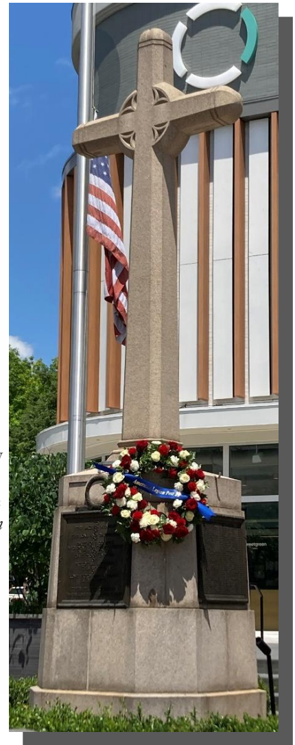
Memorial Day 2022

As always, if you have activities to share for the Post Yearbook, please email to MarkSerio@Outlook.com and include a picture or two. For God and Country.