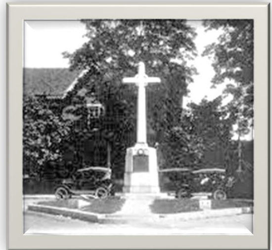
Wayside Cross 1920s