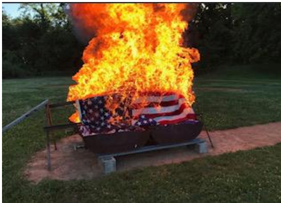
Flag retirement ceremony held at the post on in June.