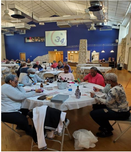
Participants playing bingo during the Towson American Legion Riders and Towson Jaycees Purse Bingo held in April.