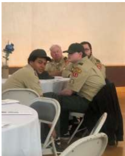
Boys Scouts Troop 151 from Hampden presented the colors during the service.