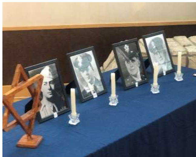
Four Chaplains memorial table.