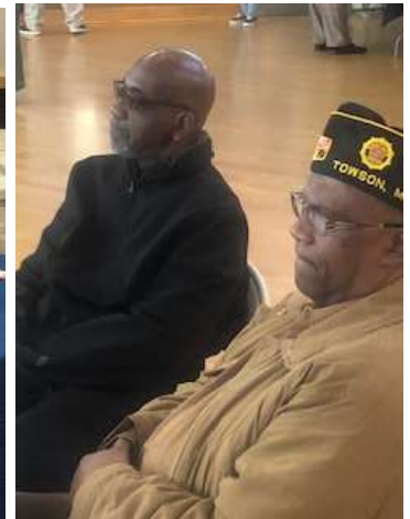
Memorial attendees listening during service.